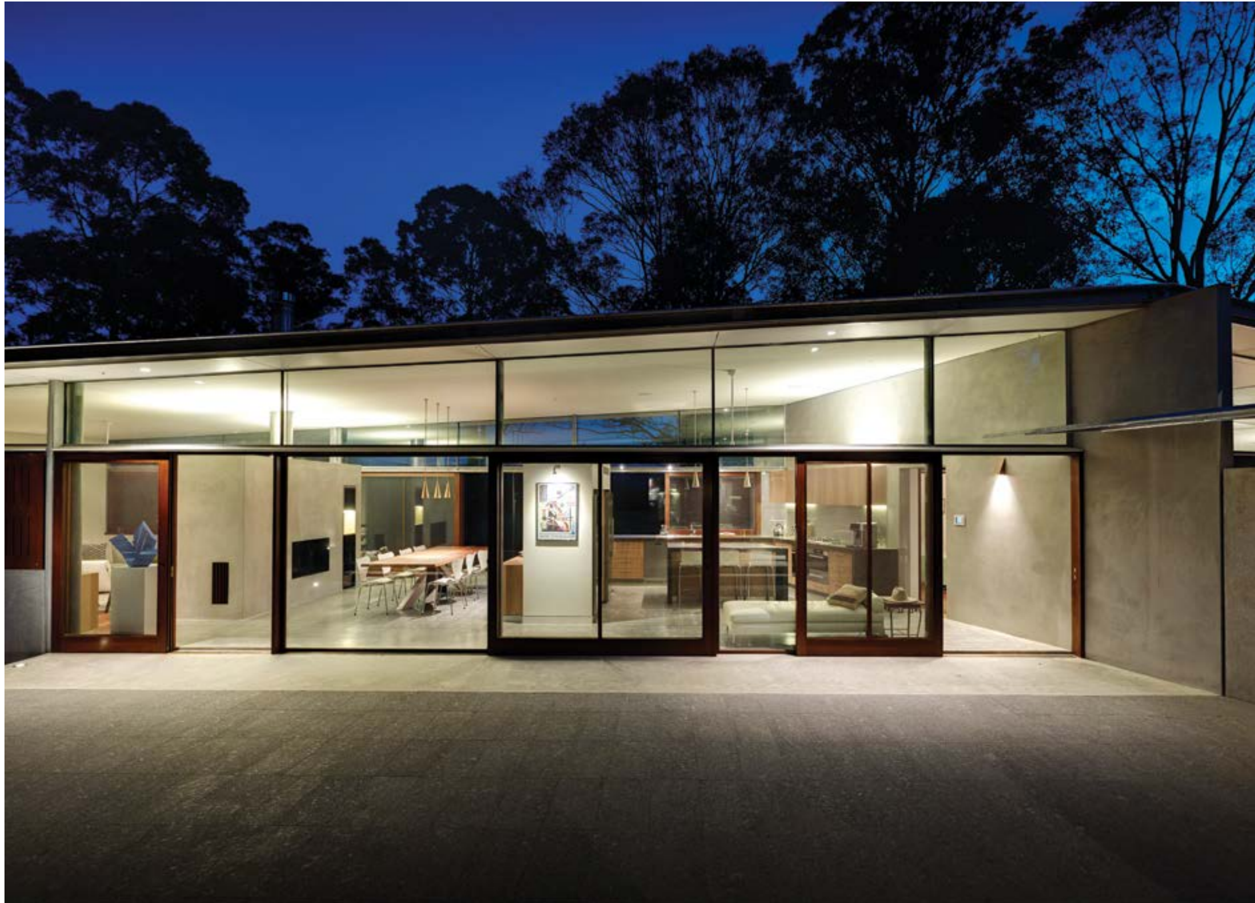
Quorrobolong House Architect Fergus Scott Architects