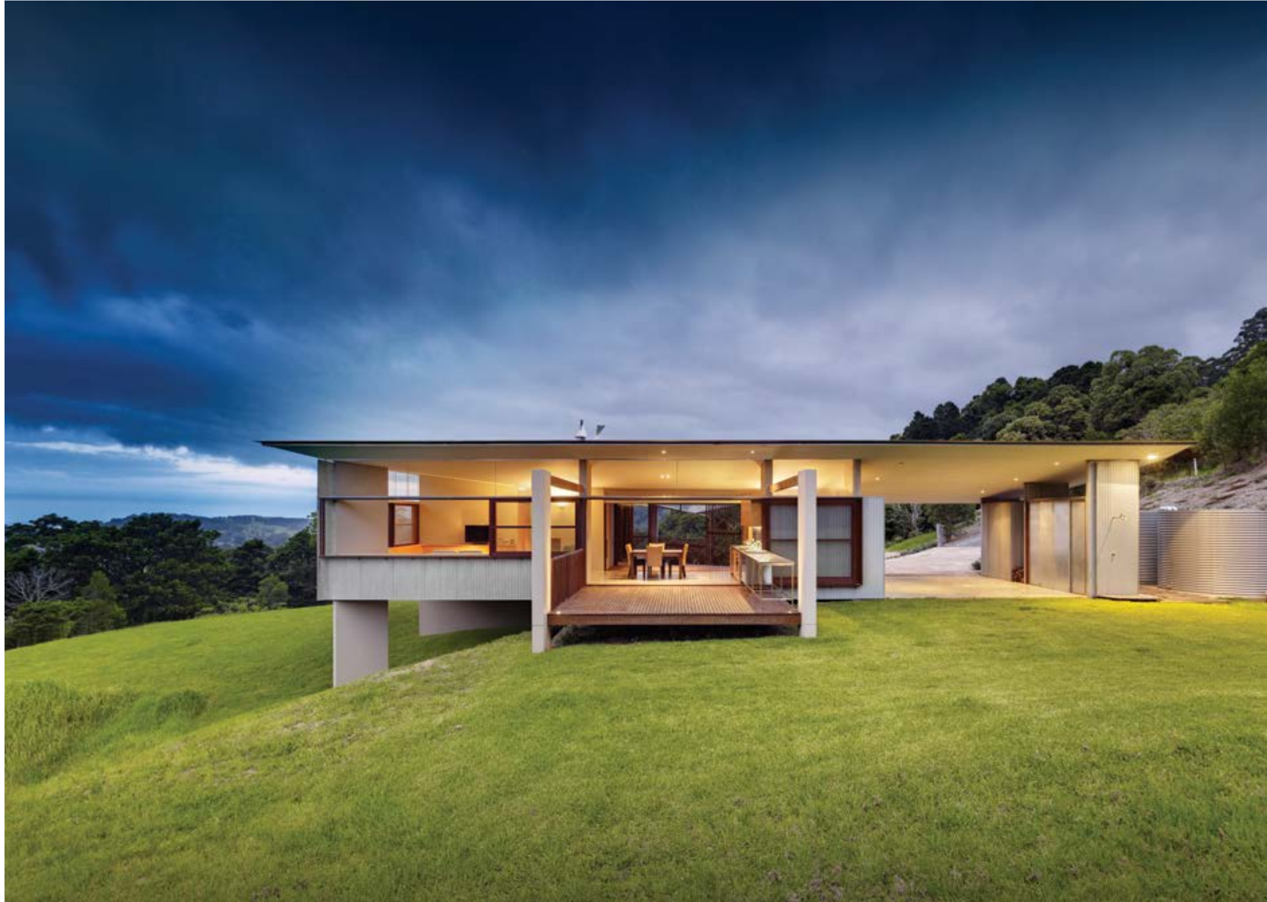
Foxground Valley House Architect Fergus Scott Architects