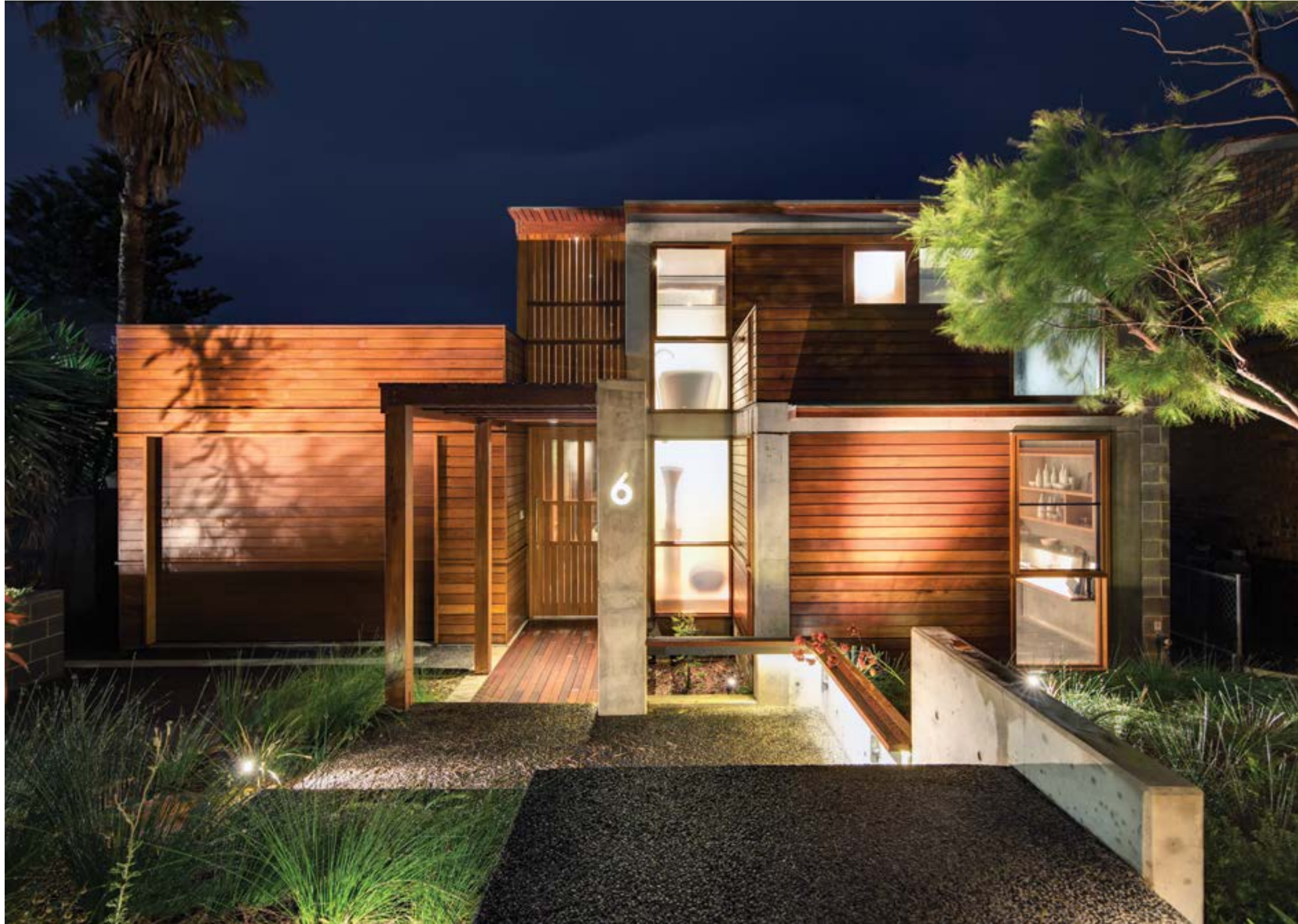
Coalcliff Residence Architect Indyk Architects Pty Ltd